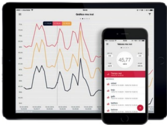
View NMIs Systems & Softwares