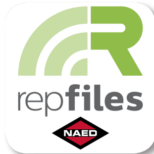
RepFiles NAED Edition For NAED members & electrical distributors