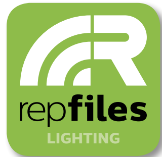
RepFiles Lighting Edition For lighting manufacturers & their sales reps