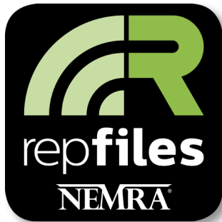
RepFiles NEMRA Edition For NEMRA members & electrical sales reps

Each feature added to the RepFiles system is designed specifically for the needs of sales teams within the electrical industry. As the industry's needs continue to evolve, RepFiles will continue to develop new features and enhancements that serve it.