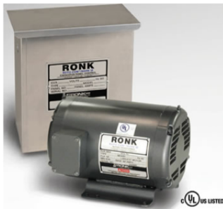
Ronk Roto Phase Converter