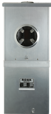
Meter Socket with Circuit Breaker