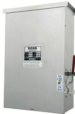
Double Throw Switches