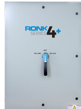
Manual Transfer Switches