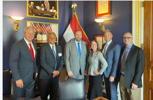
Advocating on The Hill