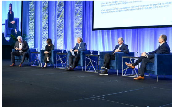
Strategic Alliance session at NEMRA25

strategic partnerships and collaborations with sister associations.