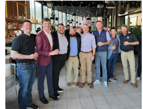
Professional Development Bootcamp in Las Vegas

opportunities for NEMRA representatives to grow, acquire, and learn new skillsets.